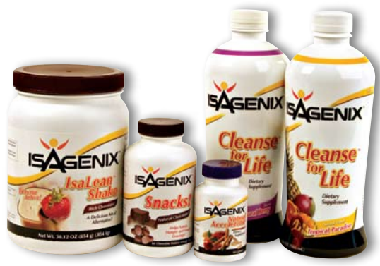
9 Day Program

Get a fast start towards optimal health and wellness with our Cleanse for Life dietary supplement. This fundamental cleansing formula with superior-quality aloe, cleansing herbal teas, lipotropic nutrients, and ionic trace minerals can help your body to naturally release harmful impurities that can slow down your metabolism. Cleanse for Life is an integral part of your Isagenix Program. Available in natural berry or tropical paradise flavors.